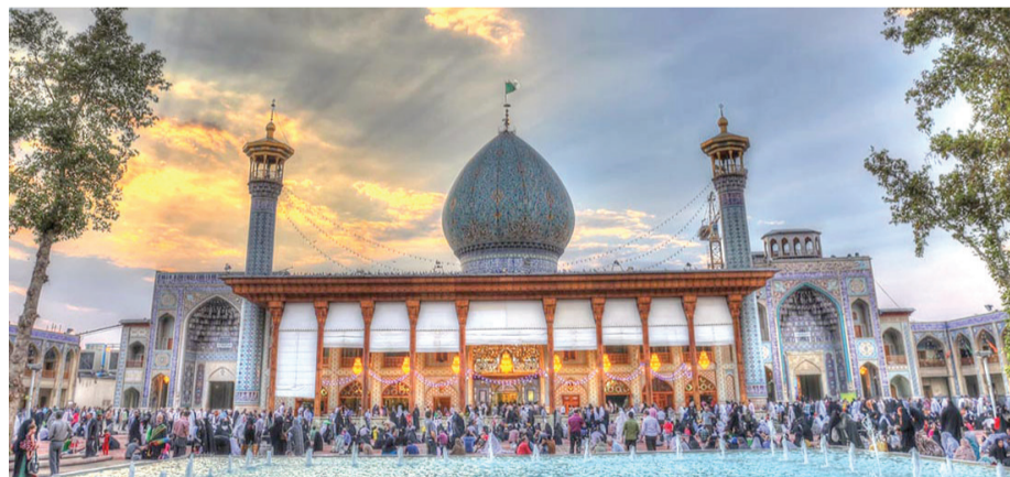
Shah Cheragh Shrine

In addition, the province boasts ancient sites. Pasargadae is among these ancient sites located near Shiraz. It was the capital of the Achaemenid Empire under Cyrus the Great (559-530 BC), who had issued its construction as well as the location of his tomb. Presently, it is an archaeological