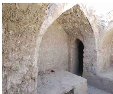
Ancient bathhouse of Kukherd fa.tripyar.com