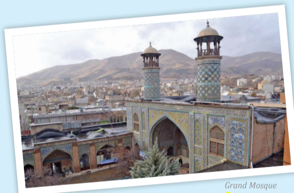
Grand Mosque

Sanandaj is the capital of Kurdestan Province. Sanandaj Bazaar is a 17th century market with a rectangular plan built by Soleiman Khan Ardalan. The roofed bazaar was built in the Safavid era, when Sanandaj was the capital of Ardalan rulers. It is considered the main traditional bazaar in the province. The bazaar was separated into two sections in the Pahlavi era (1925-1979 CE). The northern part is known as Sanandaj Bazaar, and the southern part is known as Asef Bazaar. Many modern shopping centers have been constructed in Sanandaj. Nonetheless, the old bazaar is still standing and playing its main role in the business of the city. Traditional crafts such as forging and goldsmithing are still practiced in the bazaar.