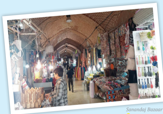
Sanandaj Bazaar ito.org

Kurdestan also boasts some of the most beautiful costumes in the world. Kurdish costumes are absolutely unique in terms of beauty, delicacy and color.