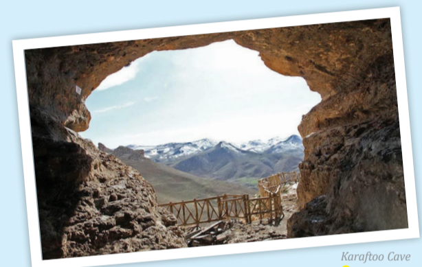
Karaftoo Cave ito.org

The Grand Mosque of Sanandaj, or Dar al-Ehsan, is located in the heart of the city. It was built in 1813 in the Qajar era (1789 to 1925 CE). The mosque represents the glory of Islamic architecture in the Qajar era. It was established by the governor of the time and became one of the historical monuments due to its specific features. The mosque is near the Anthropology Museum of Sanandaj. The Safavid era museum is located in a historic building called Asef Vaziri Mansion, which is also known as the House of Kurds. The building of Anthropology Museum of Sanandaj has been registered on Iran's National Heritage List.