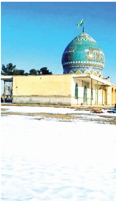
Tomb of Imamzadeh Mohammad