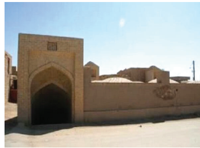
Ab-anbar of Qal'eh Boland village