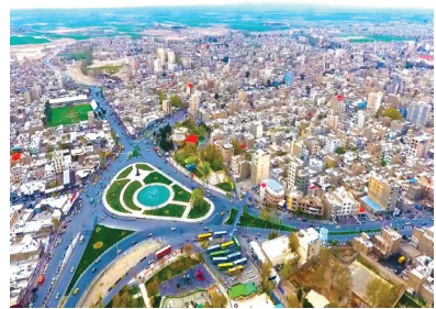
An overview of Varamin seeiran.ir