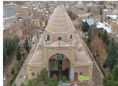
Tomb of Imamzadeh Yahya trippyar.com