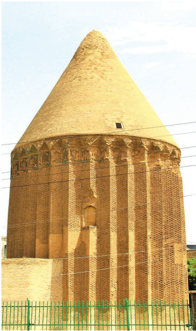
Aladdin Tower trippyar.com