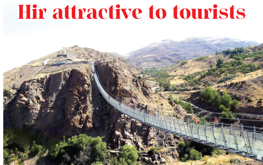
Hir Suspension Bridge

the region in ancient times. The town's weather is cold in autumn and winter, but moderate and sometimes hot in the spring and summer. Hir is home to many fruit gardens, especially cherry and sour cherry orchards, so it is called "the town of heavenly gardens" and "the town of cherry blossoms". The town, in which the world's first all-glass, suspension bridge was built, hosts a large number of tourists from various parts of the country and the world every year. This suspension bridge is about 200 meters long and about 100 meters above the ground. The width of