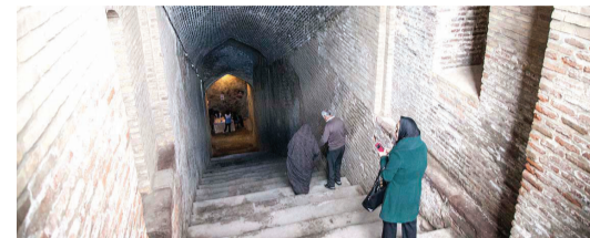
Ab Anbar of Qazvin Grand Mosque