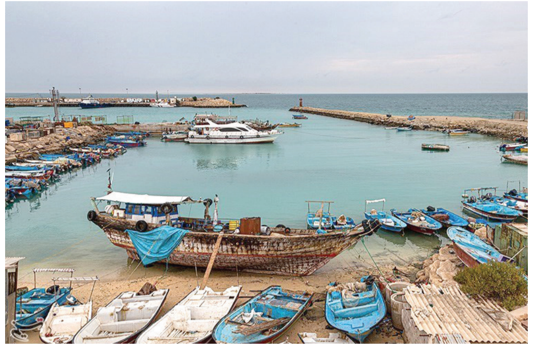
Kharg Island