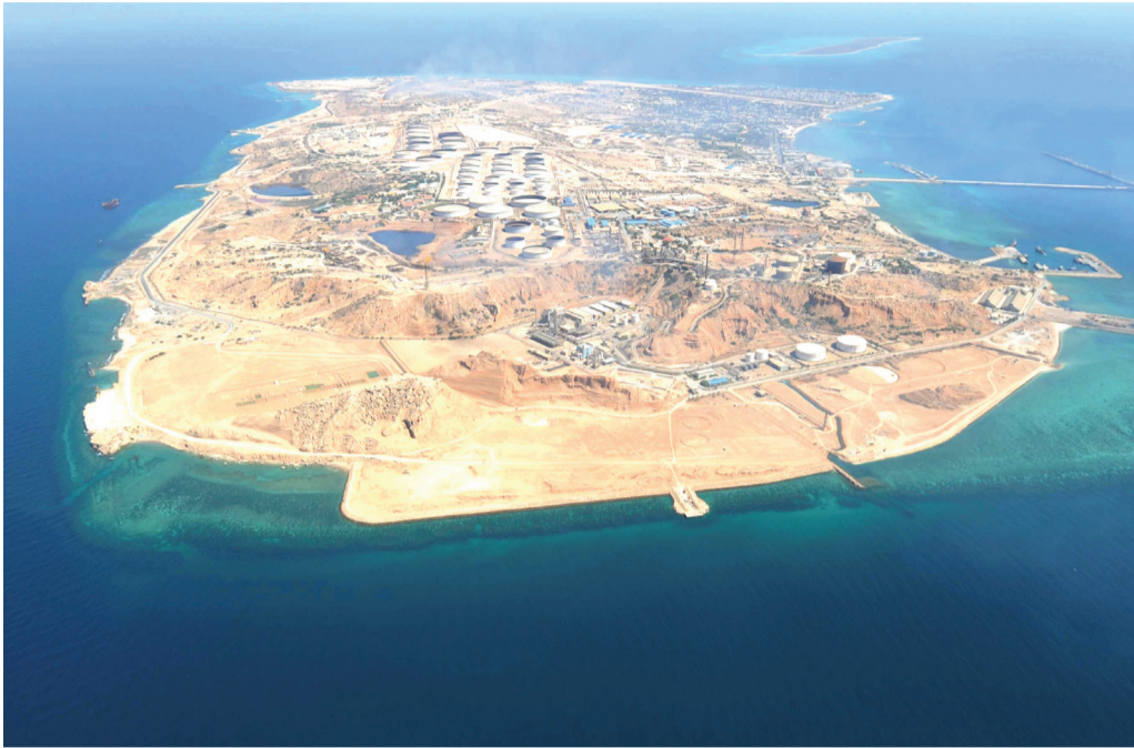
Kharg Island