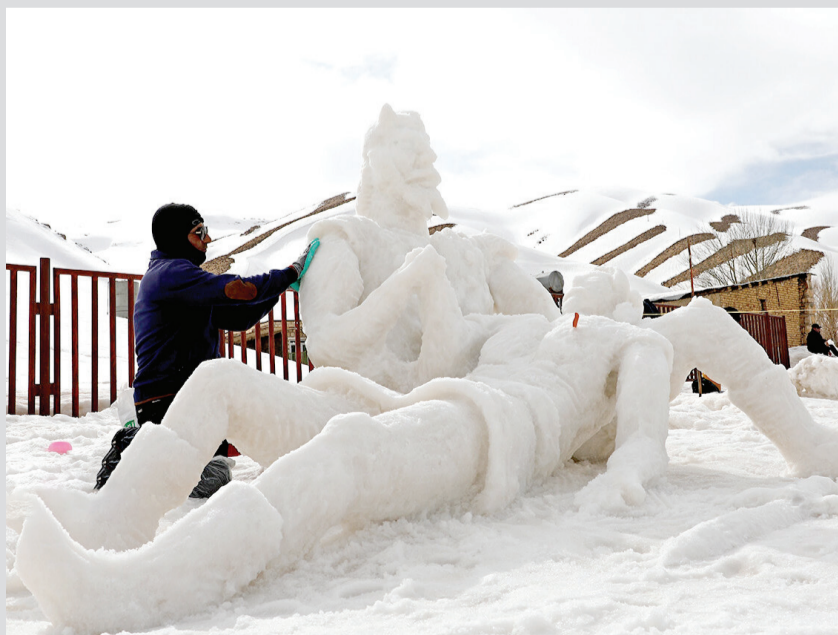
Artists make snow sculpture during a festival in the city of Koohrang in Chaharmahal and Bakhtiari Province, Iran, on March 12, 2023.

ters to five meters is hard. With hot and humid summers, the formation of this island is the result of gentle geological folds in the shape of an arch.