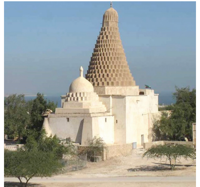
Nestorian Church iraniantours.com

the Iranian Army, the Island was liberated and the foreign forces left the land of Iran. Gazelles, hawksbill sea turtles, green sea turtles, goats, large white-headed seagulls, ospreys, house crow and migratory birds are some of the animals that inhabit Kharg Island. Aquatic animals like fish, crabs, shrimp and leopard shark are among the other creatures living on the island. Bread-leaved Banyan tree, mesquites, jujubes, palm and lavender trees are among plant species that grow on Kharg Island. The texture of Kharg Island is composed of fossils and limbs of coral reefs, bivalves and other marine animals mixed with sand, and only a thin layer of the island's surface, with a thickness of about 20 centime-