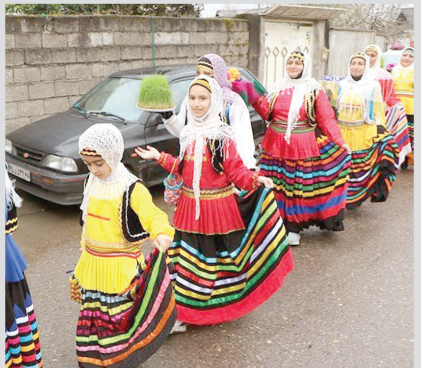
Women in local traditional clothes carry haft-seen items in Astaneh-ye Ashrafiyeh, Gilan Province, on March 10, 2023, to welcome Norouz, the Iranian New Year, which begins on March 21, 2023.