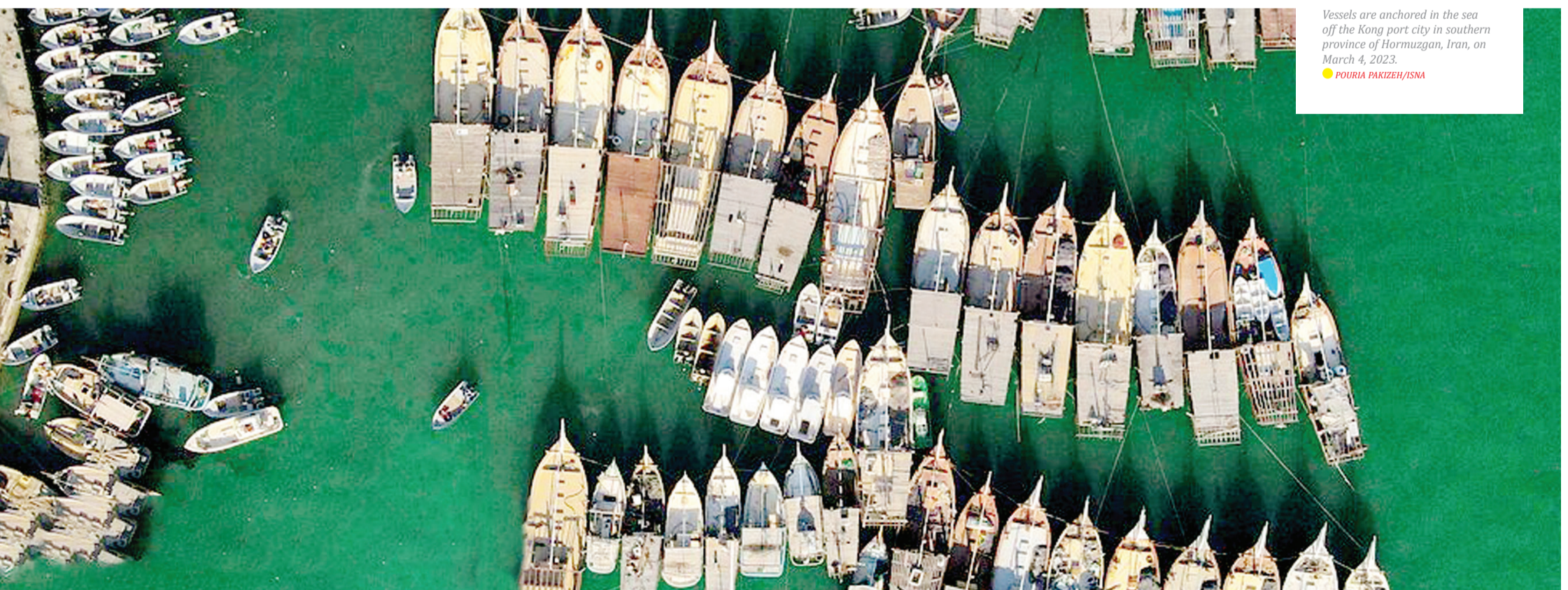
Vessels are anchored in the sea off the Kong port city in southern province of Hormuzgan, Iran, on March 4, 2023.

Last month UAE Energy Minister Suhail Al Mazrouei, speaking to Bloomberg television in Dubai, reiterated that the country remains committed to OPEC+ production for the rest of 6467.