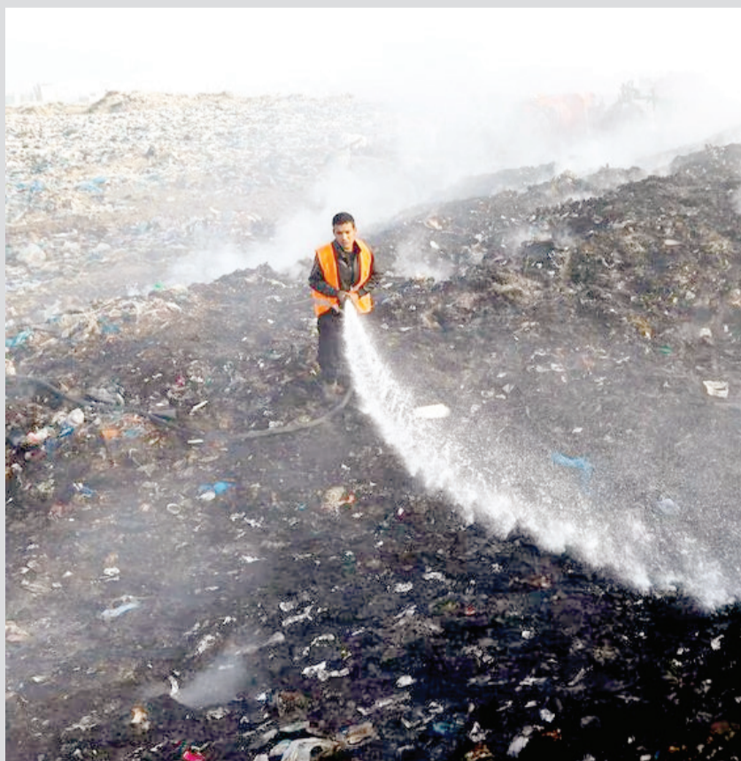
A Palestinian fireman extinguishes a fire at a landfill in Juhr al-Deek, southeast of Gaza City, on March 3, 2023. Officials are calling for help to extinguish the fire that started on Thursday, saying it could last for days and cause "an environmental catastrophe".

not immediately respond when contacted by Reuters. Energy companies are already preparing to amend bills to reflect the current level of support being renewed rather than reduced in April, according to a separate report by the BBC on Friday.