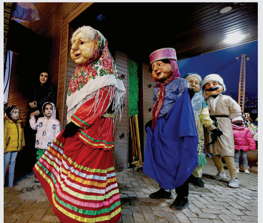
'Hot Winter' festival is underway at Aab-o Atash Park in Tehran, Iran until March 3.