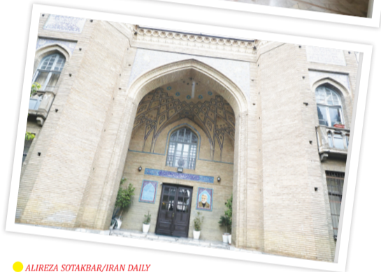
● ALIREZA SOTAKBAR/IRAN DAILY