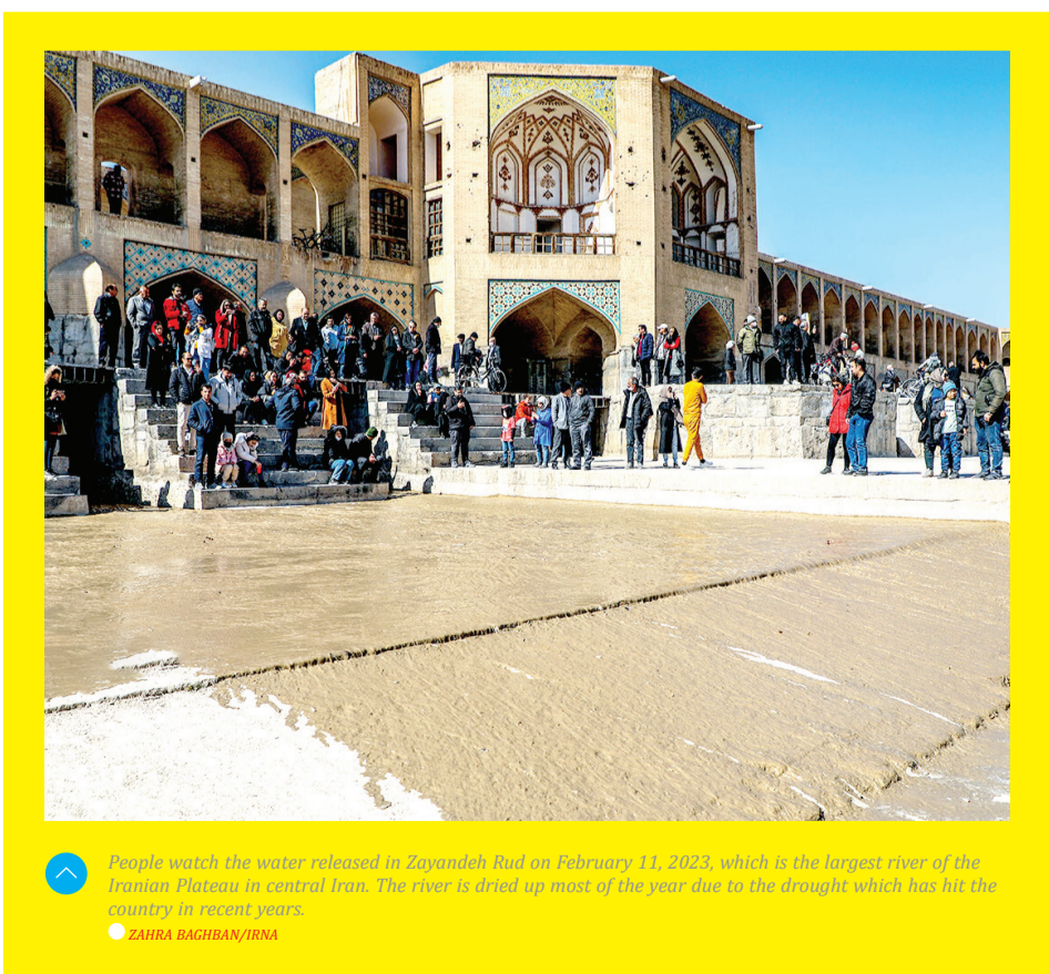
People watch the water released in Zayandeh Rud on February 11, 2023, which is the largest river of the Iranian Plateau in central Iran. The river is dried up most of the year due to the drought which has hit the country in recent years.