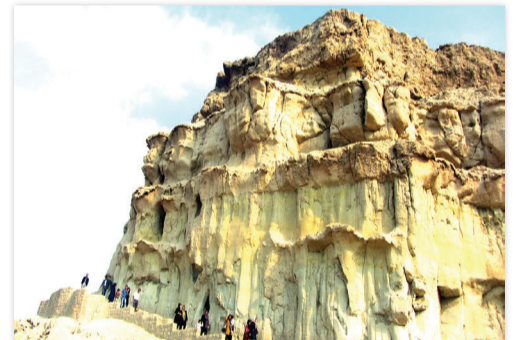
Khorbas Cave itto.org