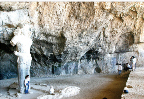
Shapur Cave

Located on top of a hill, 20-30 meters high, villagers have dug shelters with halls, corridors, and various rooms to live in. There is even a pond to store water inside the cave, which was used for defense against invaders but could also have been an Anahita Temple.