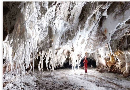
Namakdan Salt Cave lugs-geoheritage.org