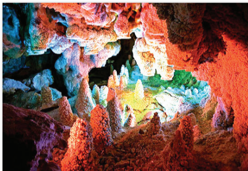
Chal-e Nakhjir Cave bartarinha.ir