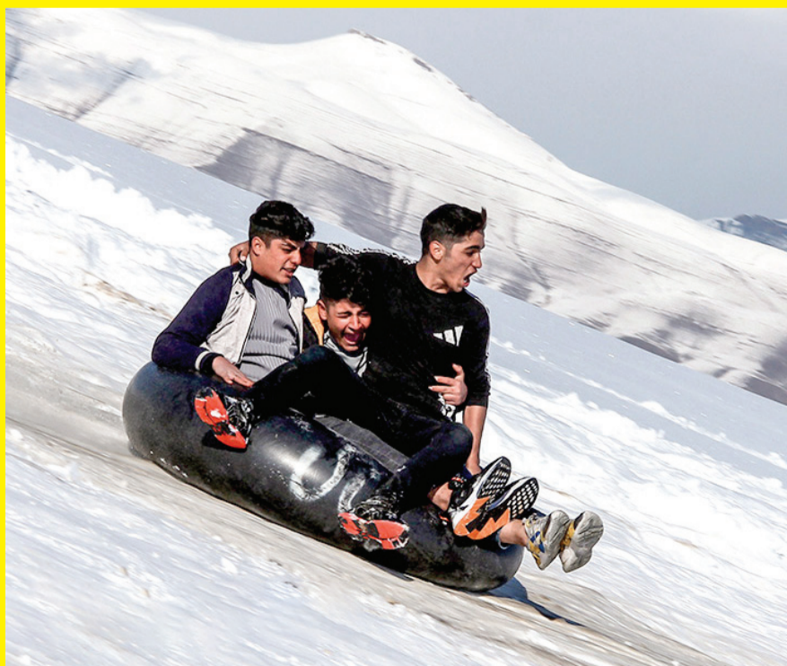
Youth enjoy winter in a snow-tubing resort in northwestern city of Urmia in Iran's West Azarbaijan Province on February 12, 2023.

The series first appeared in 1929 and continued until Hergé's death in 1983 at the age of 75.