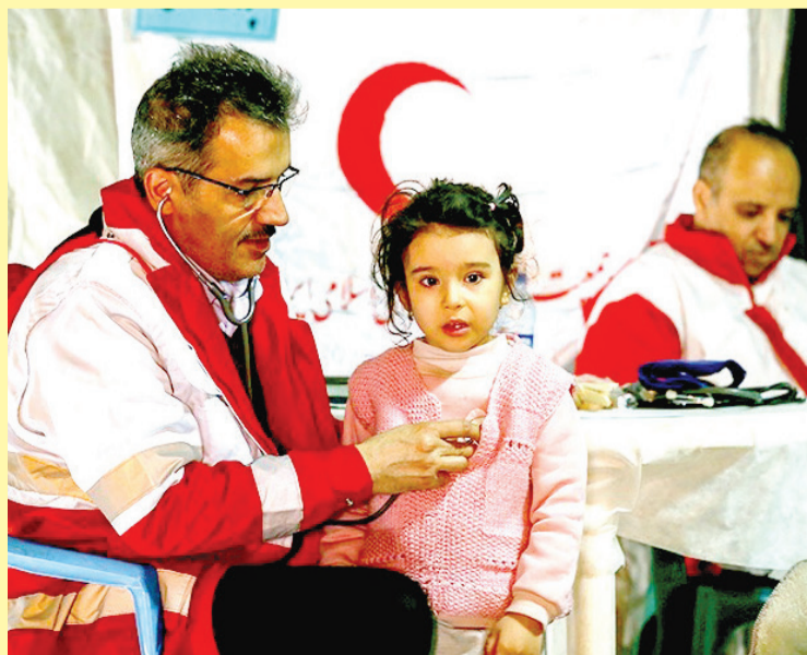
A member of the Iranian Red Crescent Society checks the little girl's heartbeat in the IRCSS tent in Khoy, more than a week after a magnitude of 5.9 hit the northwestern city in West Azarbaijan.

red serpent, was completed in 1907 during Klimt's so-called golden period when he embraced the gold-leaf techniques he is known for today.