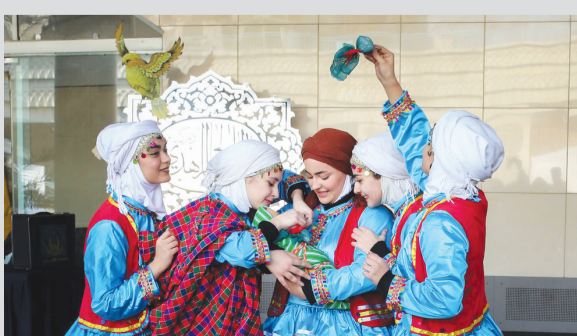
Actresses perform a street theater in the waiting platform of the Valiasr subway station on January 30, 2023, as the last day of the Fajr Theater Festival was held in Tehran, Iran.

The service road in front of Unnayan Bhavan has been relaid with fresh bitumen, and the space in front of the fair ground has been spruced up with decorations and lights. There will be tight security in Karunamoyee and Central Park.