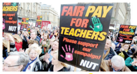
● DAILY MIRROR

The mass closure of schools expected across England and Wales due to teacher strikes next week will be a "good example" to pupils, the head of the UK's largest teaching union has said.