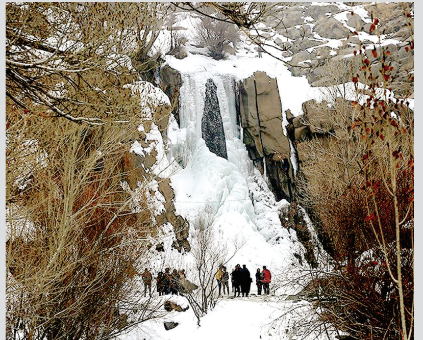
Visitors to Ganjnameh Waterfall watch the frozen waterfall in Iran's western Hamedan Province, on January 26, 2023.

a beautiful combination of extremely authentic Iranian/Islamic works, as well as modern art, and this combination has led to the opening of this exhibition. I would like to thank all the dear artists of my country, both those whose works were not selected and those whose works were selected. This great event was created by artists, and another golden leaf of visual arts of the Islamic Revolution will be turned in the 15th edition [of this festival]." Five hundred and fifty artists from 31 provinces of Iran are participating in the "Imagination of Arts" category.