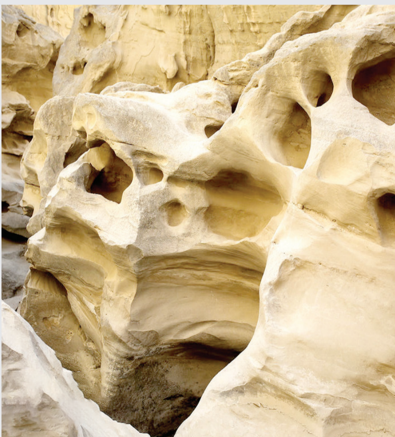
The photo shows rain-carved rocks in Chahkooh Canyon on Iran's southern island of Qeshm. The astonishing canyon is registered on the UNESCO World Heritage List as part of the Qeshm Geopark.

By using CT scans, the team of scientists shed new light on the boy's high social status by affirming the intricate details of the amulets inserted within his mummified body and the type of burial he received.