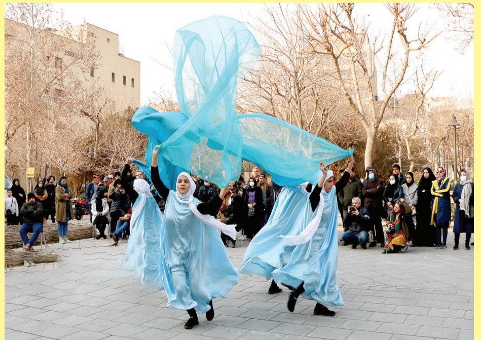
A street performance of Fajr Theater Festival is held on its fourth day - January 24, 2023 - in Tehran, Iran.

Pointing to the existing problems in the unilateral visa waiver program, Zarghami rejected the criticisms that the visa cancellation needs to be bilateral.