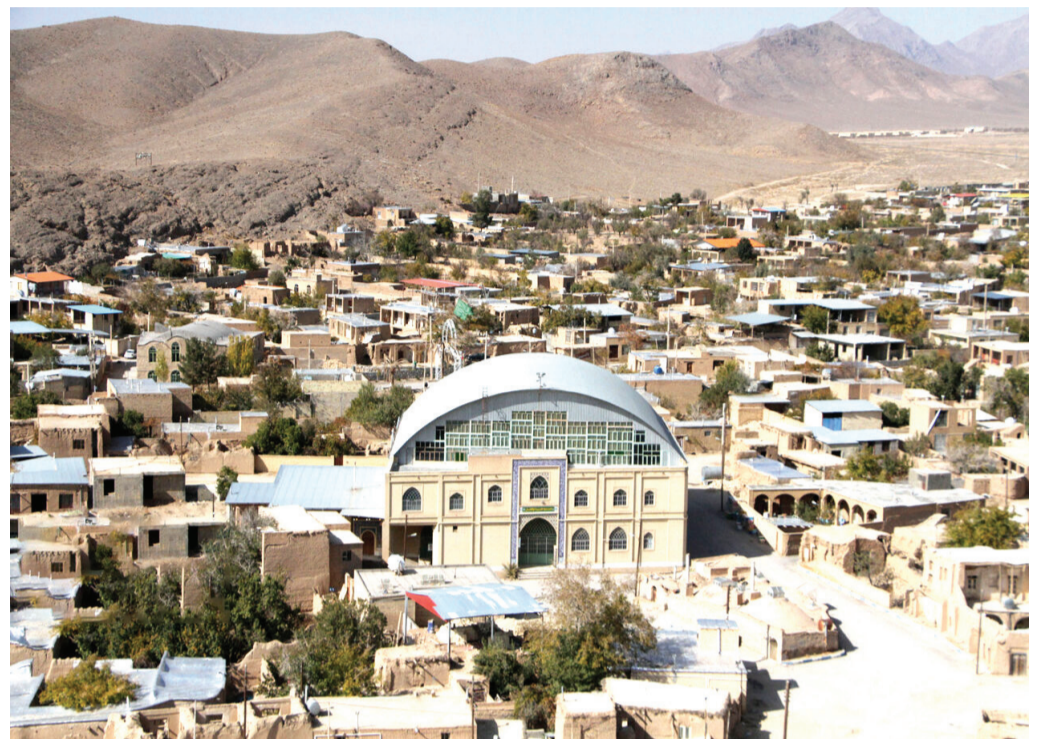
An overview of Taft IRNA