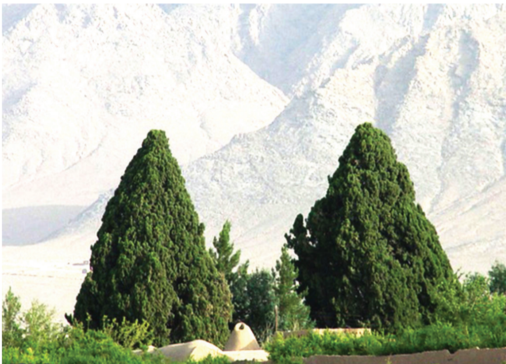
Sarv-e Dota, Mobarakeh village tabiatgardeshgaran.ir