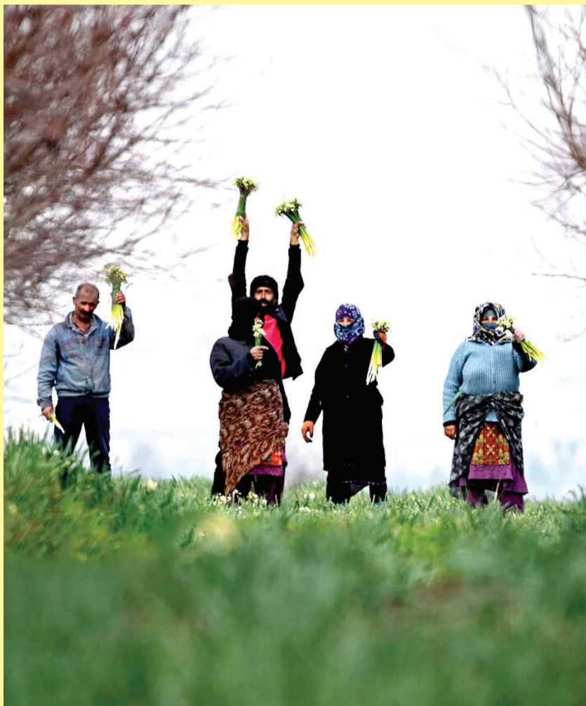
Farmers in Azadshahr, Golestan Province have begun harvesting narcissus flowers. The harvesting began in December and continues to date. The pleasant aroma of this beautiful flower tickles the nose of every passerby.