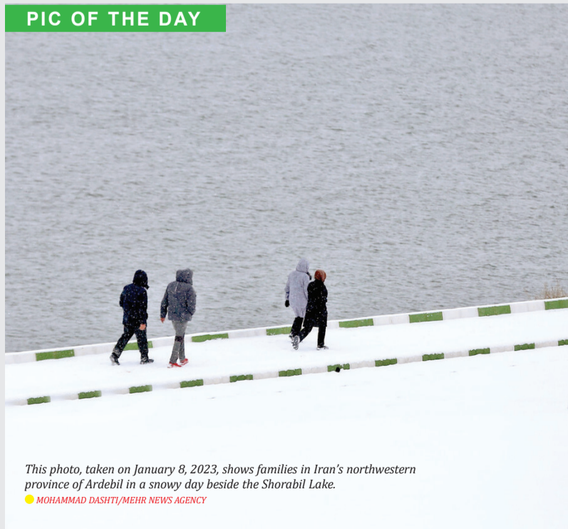
This photo, taken on January 8, 2023, shows families in Iran's northwestern province of Ardebil in a snowy day beside the Shorabil Lake.