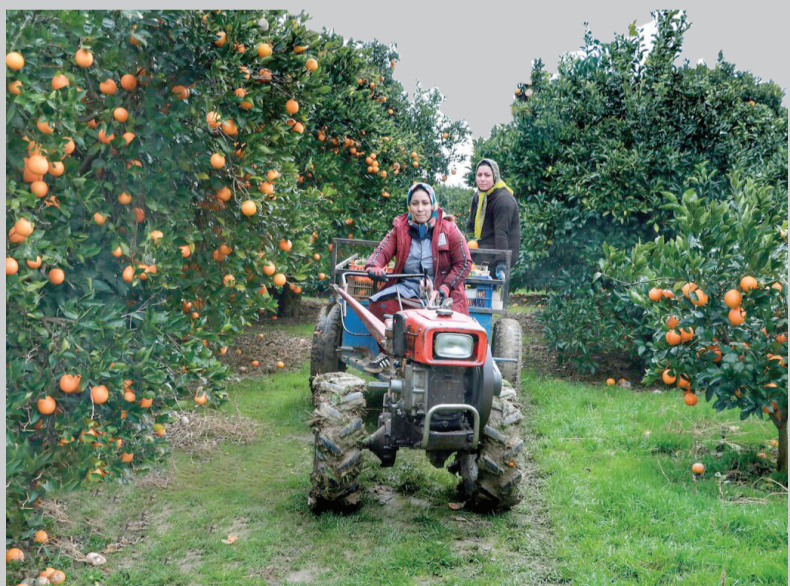
A woman rides a two-wheel tractor in an orange orchard in Mazandaran Province, on January 6, 2023, as the harvest season has started in northern Iran.