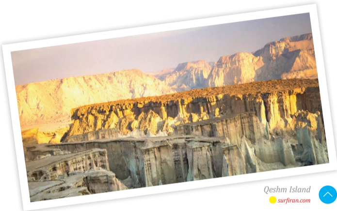
Qeshm Island