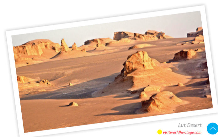
Lut Desert visitworldheritage.com

Qeshm Island is the largest in the Persian Gulf. As temperatures can reach up to 50° Celsius in the summer, winter is the perfect time to visit the island. As beaches are many and visitors few, it's possible to swim peacefully with nobody around. From Qeshm, it is also possible to go to Hengam Island, another small island full of pristine sand beaches.