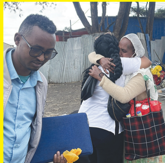
Passengers arriving from the war-torn region of Tigray are greeted by relatives at the Bole International Airport in Addis Ababa on December 28, 2022.

as business management, economics, industrial engineering, entrepreneurship, science policy, technology and innovation, marketing and science. It is information and science. The interdisciplinary approach of the current conference is a turning point in holding conferences in the field of public libraries to link related fields in the maximum benefit of scientific policy, or in other words, targeting the outputs of scientific research to solve social issues and needs. The deadline for receiving the full articles is July 1. On September 31, the arbitration results will be announced.