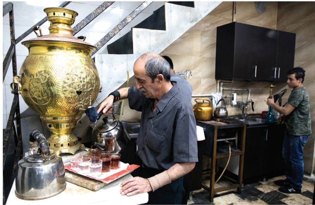
● SAJJAD SAFARI/IRAN DAILY